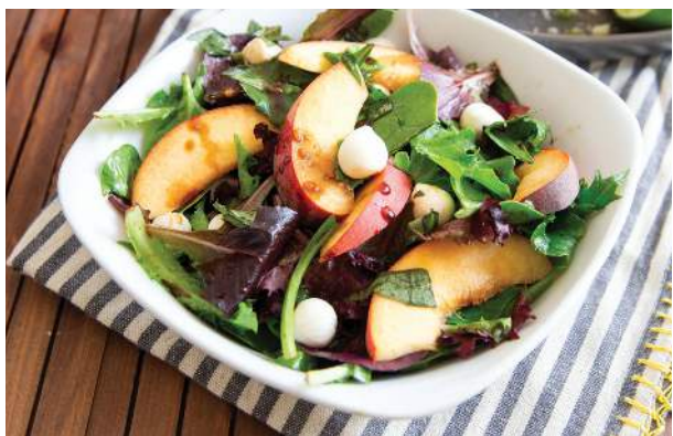
Balsamic Peach Salad