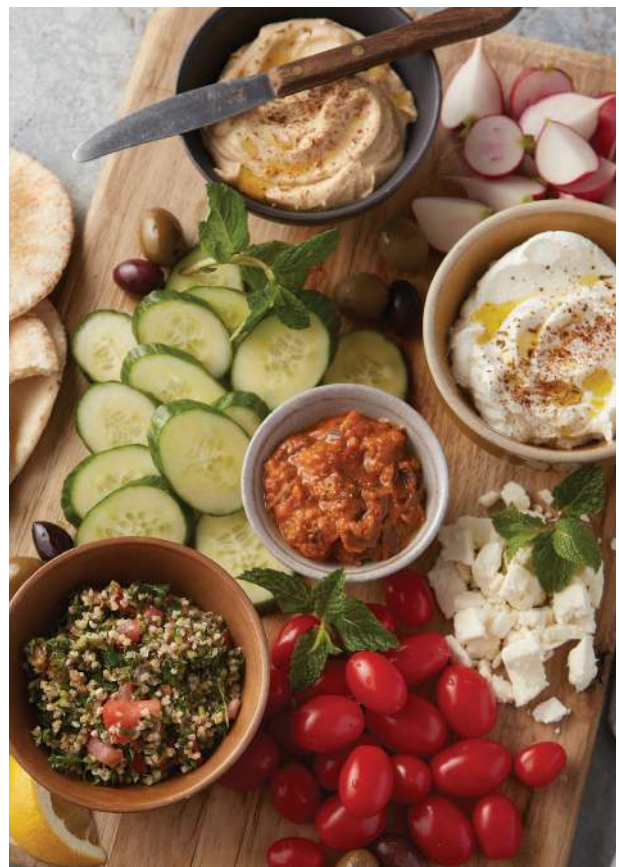
Mezze Board with Labneh

Check out grocery.coop for the recipes shown below: