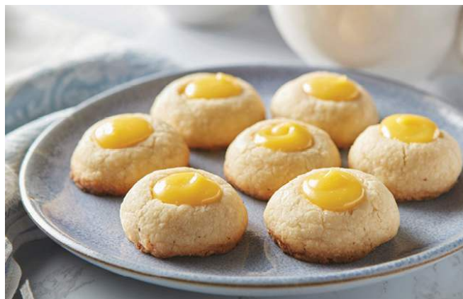
Lemon Curd Blossoms