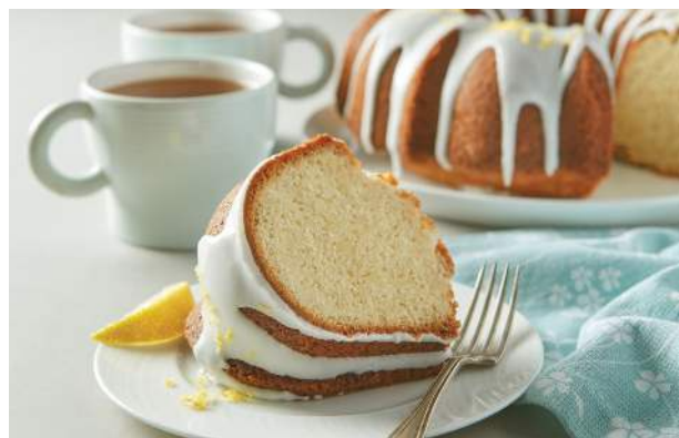
Cardamom Bundt Cake