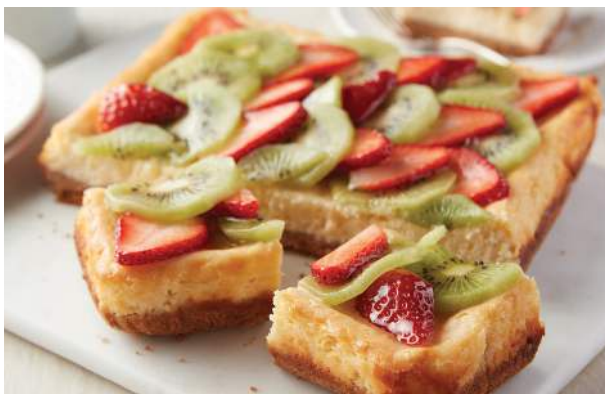
Kiwi Strawberry Cheesecake Bars

Check out grocery.coop for the recipes shown below: