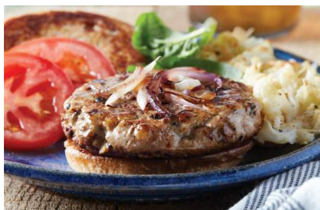
Mushroom Turkey Burgers

Check out grocery.coop for the recipes shown below: