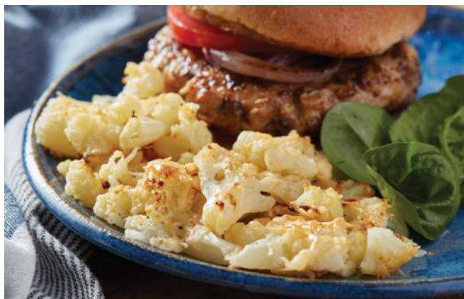
Smashed Cauliflower with Parmesan